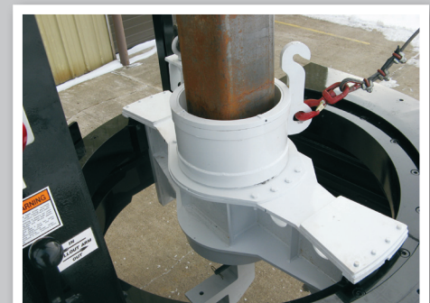
51" heavy duty turntable

Tandem axle truck, trailer, skid, or track mounted • Customizing obtainable